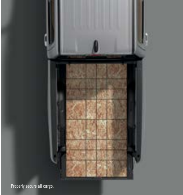
Properly secure all cargo.