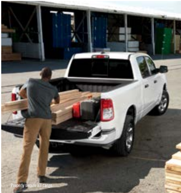
Properly secure all cargo.