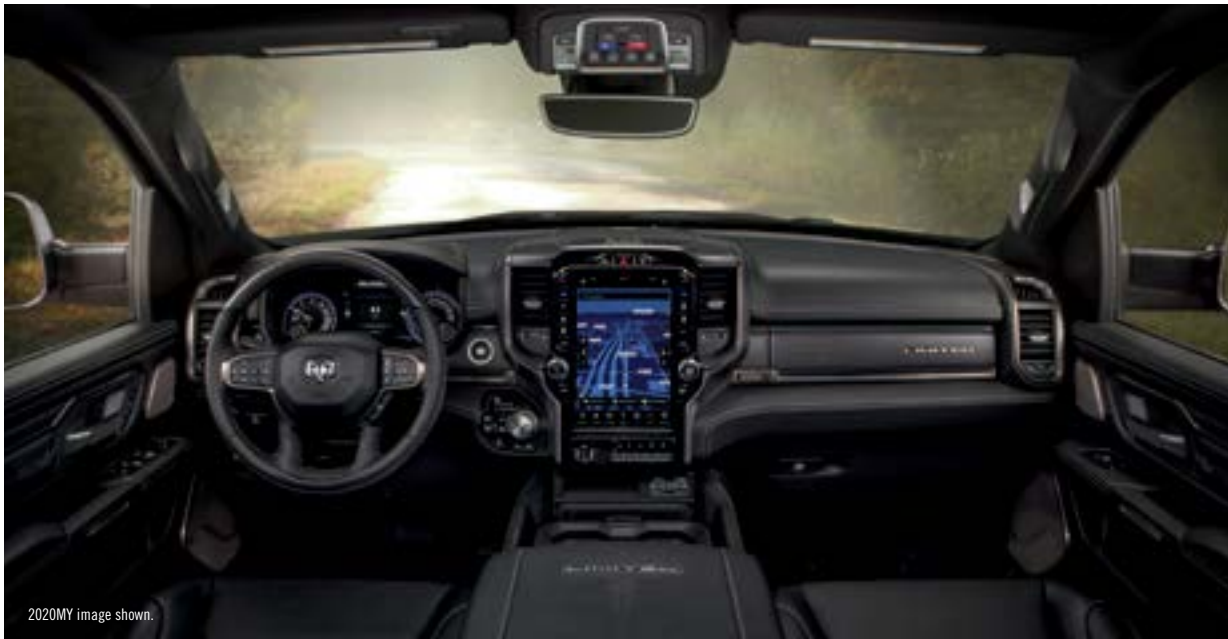
2020MY image shown.